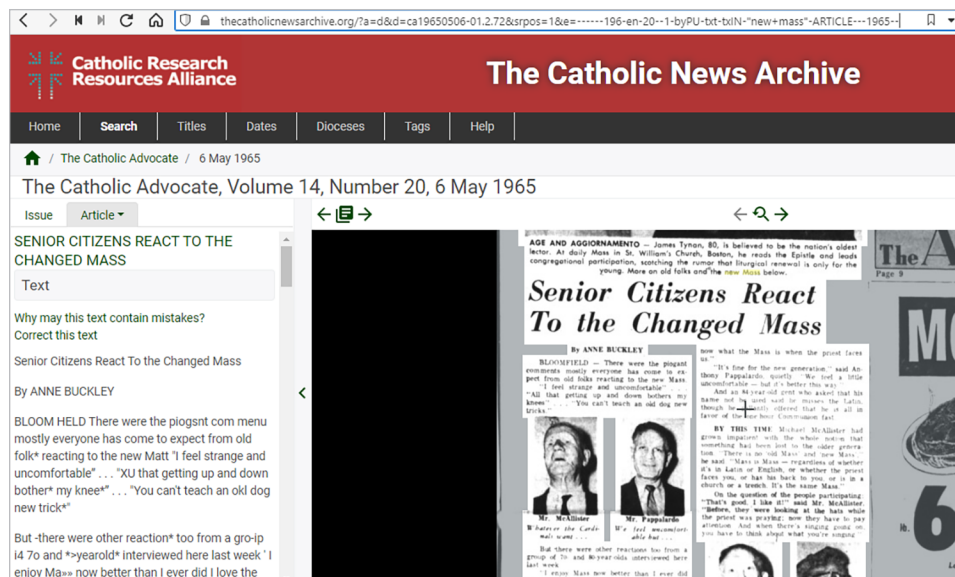
FIGURE 6 Catholic News Archive Example of a Newspaper Article with Search Terms Highlighted

ca19650506-01.2.72&srpos=1&e=-----196-en-20--1-byPU-txt-tx-IN-"new+mass"-ARTICLE---1965--. "ca" is The Catholic Advocate, the issue date is 1965-05-06, "byPU" shows that the searcher's results were sorted by publication title, the search terms were "new mass," category was filtered to "article," and date was filtered to "1965" (see Figure 6).